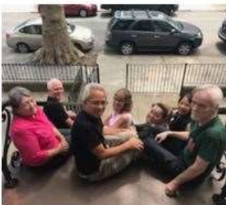
UNI Board members sitting on the stoop in front of our old apt. They faithfully come every year for the UNI board meeting. We always have a very fruitful & encouraging