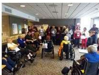
Convalescent Home where we sang songs, shared & prayed for these dear precious elderly folk.