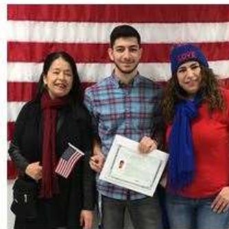
Our young Kurdish friend receiving his USA Citizenship Certificate! His family (mom next to him) came here on Asylum from Syria when they had to flee for their lives.